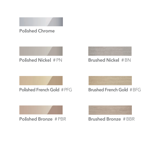
Please consult a TOTO representative for details